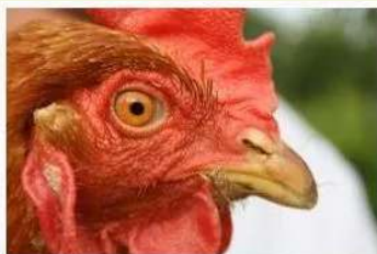
Beak tipped hen at 72 weeks

It is virtually impossible for a chicken to find its spot in the pecking order when reared under intensive farming conditions. Because of this, some frustrated chickens often peck at one another relentlessly causing injury or even death. They must also compete for food and water which can lead to aggressive behaviour even resulting in cannibalism. To overcome this, farmers will remove the tip of a chicken's beak using an infrared laser when it is just a few days old, with no anesthetic at all. Done too severely this can cause open wounds, leading to bleeding from the beak and cause pain to the chicken especially when trying to eat.