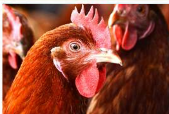
Non-tipped hen at same age